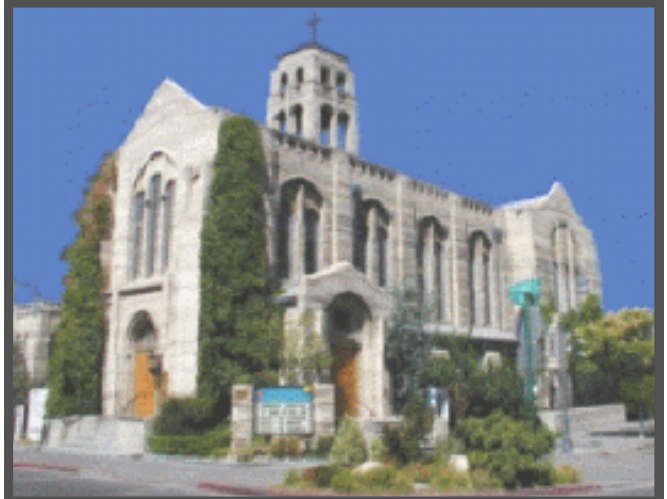
First United Methodist Church