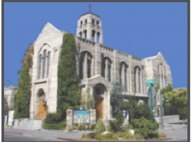
First United Methodist Church